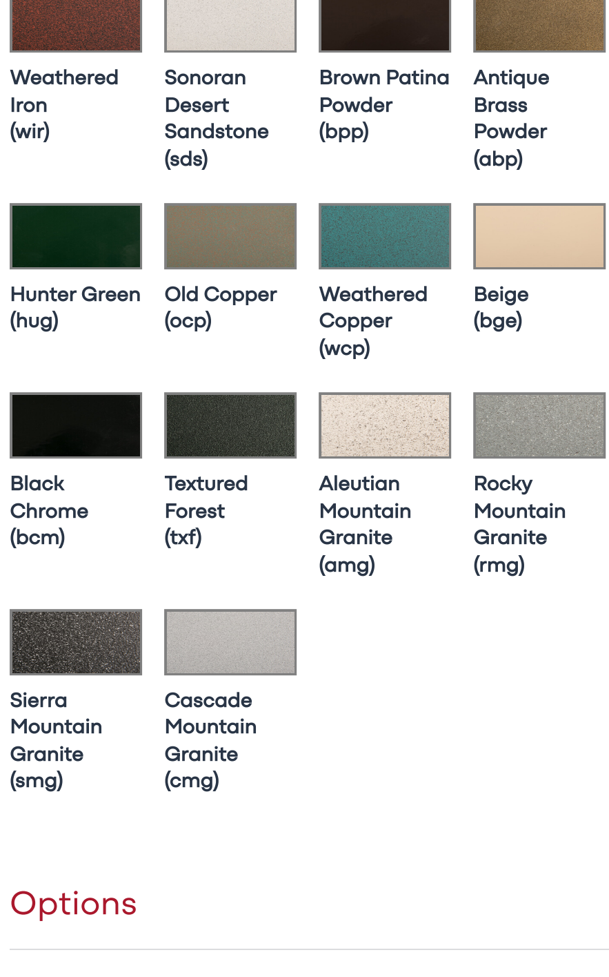
Natural Brass Powder (nbp) | Antiqued White (aqw) | Cream (crm) | Clear Anodized Powder (cap) | Weathered Iron (wir) | Sonoran Desert Sandstone (eds) | Brown Patina Powder (bpp) | Antique Brass Powder (abp) | Hunter Green (hug) | Old Copper (ocp) | Weathered Copper (wcp) | Beige (bge) | Black Chrome (bcm) | Textured Forest (tfx) | Aleutian Mountain Granite (amg) | Rocky Mountain Granite (rmg) | Sierra Mountain Granite (smg) | Cascade Mountain Granite (cmg)