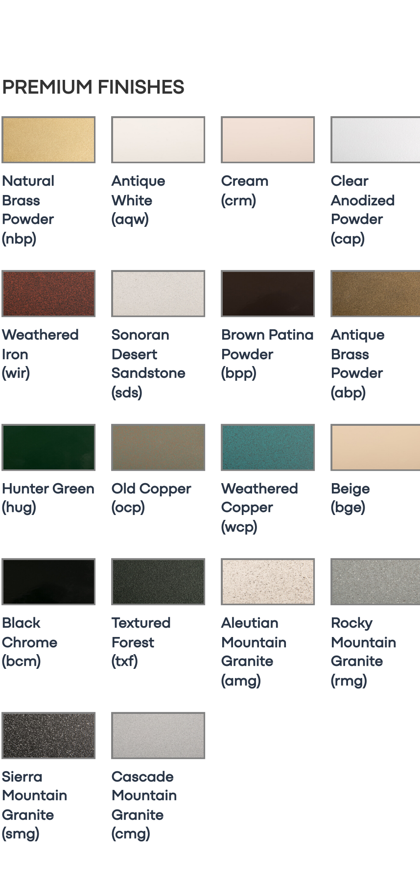
Natural Brass Powder (nbp), Antique White (aqw), Cream (crm), Clear Anodized Powder (cap), Weathered Iron (wir), Sonoran Desert Sandstone (sds), Brown Patina Powder (bpp), Antique Brass Powder (abp), Hunter Green (hug), Old Copper (ocp), Weathered Copper (wcp), Beige (bge), Black Chrome (bcm), Textured Forest (tfx), Aleutian Mountain Granite (amg), Rocky Mountain Granite (rmg), Sierra Mountain Granite (smg), Cascade Mountain Granite (cmg)